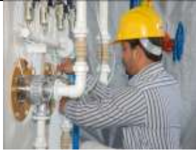
4. TURBO EXPANDER