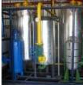
PURIFICATION UNIT-LOW POWER