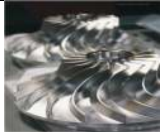
TURBINE VANES- LONG LIFE-FASTEST COOLING