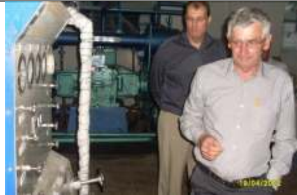
UK GAS WITH LINDE