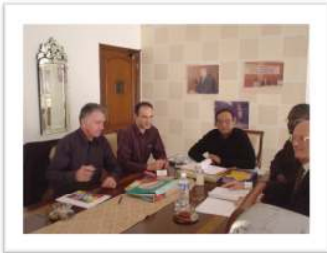
AIR LIQUIDE FRANCE ENGINEERS AT OUR NEW DELHI OFFICE