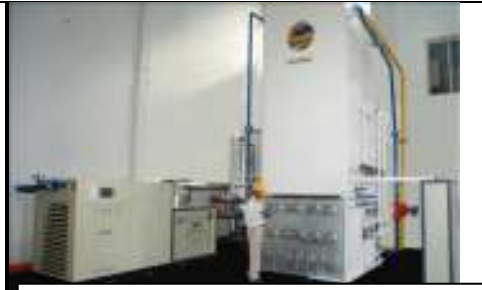
UBT TURBO OXYGEN PLANT INSIDE FACTORY