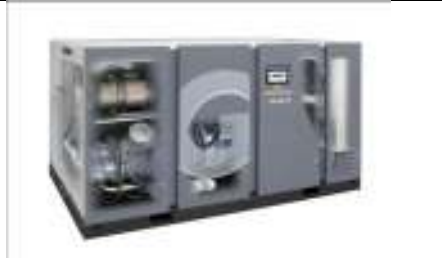
AIR- COMPRESSOR LOW-PRESSURE